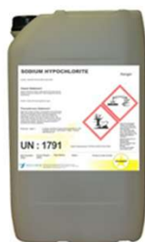
Sodium hypochlorite at 500 ppm